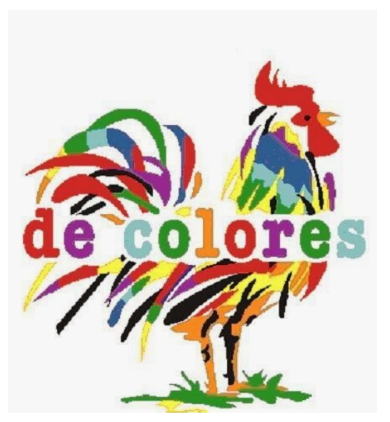
Make a Friend, Be a Friend, Bring a Friend to Christ.